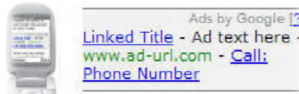
AdSense for Mobile Example

Note: AdSense for Mobile not work in all areas right now. Hope that Google will enable this feature worldwide in near future.